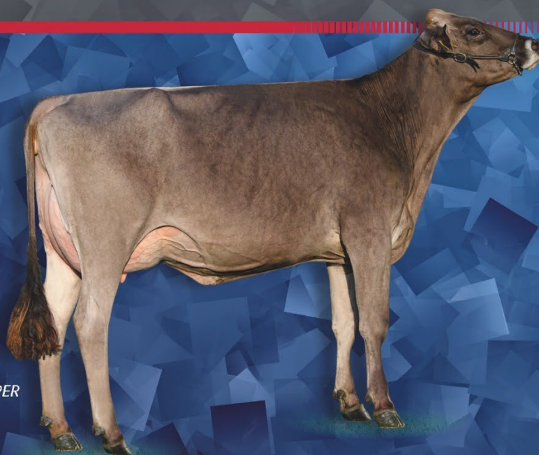
Tellis Pete PIPPER