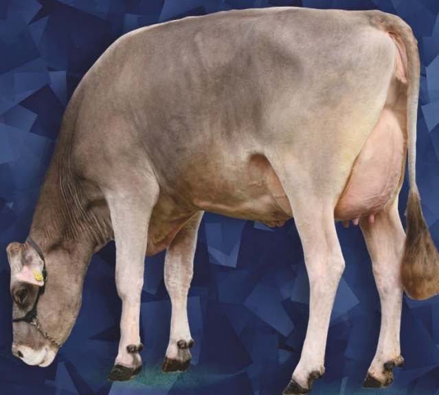
Mutter: GoldHill Bender CALANA SG-ET