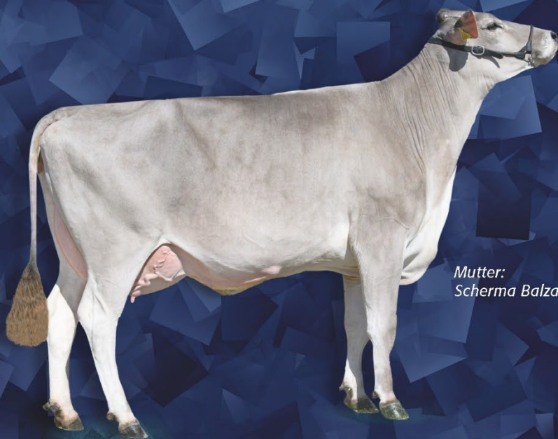
Mutter: Scherma Balzac GRIOTTE